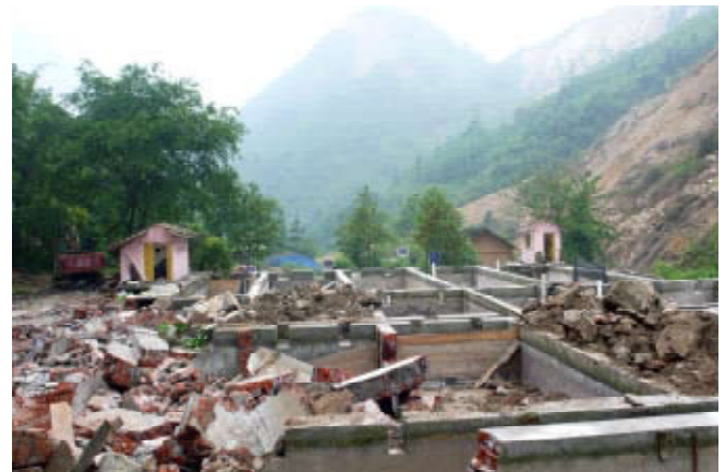
More of the damage to China's aquaculture caused by the May earthquake.

The members of the AquaFish CRSP express our deepest sympathy for the losses of those in the Sichuan Province in the People's Republic of China as a result of this year's earthquake. We wish the best for all its citizens.