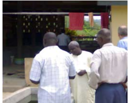
Members of ANAF visiting the aquaculture research station in Ghana

Critical to achieving the goals of the Action plan is the need for major investments to build capacity in African institutions for planning, research and technology transfer through a strengthened network of training and research facilities around the continent. Therefore, in support of the NEPAD' Pan-African vision, FAO has put in place the Aquaculture Network for Africa (ANAF) as a vehicle with which to create new knowledge-based institutions in