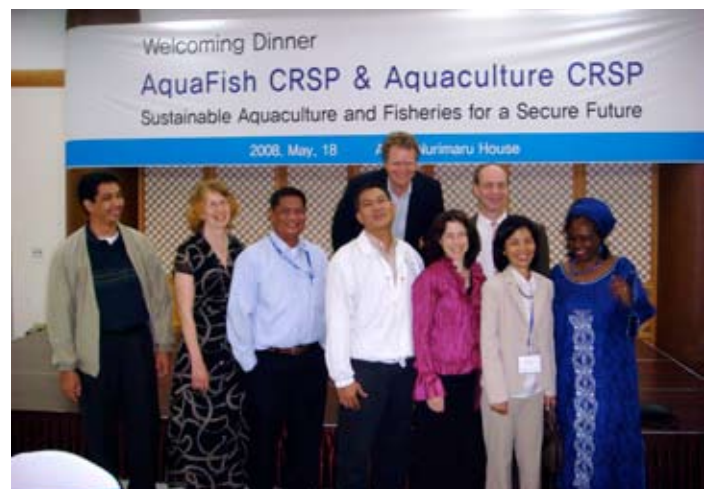
CRSP Participants gather for the Welcome Reception at the Annual AquaFish CRSP Meeting in Busan, Korea.

This abstract is excerpted from the original paper, which was published in World Aquaculture , 39: 41-6. March 2008.