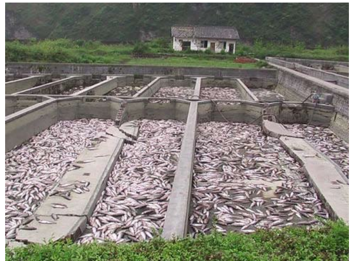
China's aquaculture industry was hit hard by the 12 May 2008 earthquake.