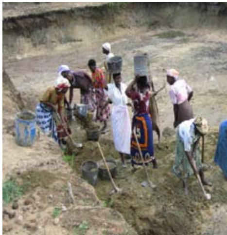
Women digging ponds in Malawi

The New Partnership for Africa's Development (NEPAD) recognizes the vital contributions by the African fish sector to food security and income of many millions of Africans, to poverty reduction, and economic development in the continent. It further recognizes the growing opportunities and emerging successes of aquaculture development in the region. Within the framework of the Comprehensive Africa Agriculture Development Program (CAADP), the NEPAD Action Plan for the Development of African Fisheries and Aquaculture, which was endorsed by African Heads of States and Government during the Abuja "NEPAD Fish For All" summit in 2005, provides the framework for channelling investments to safeguard and further increase these benefits.